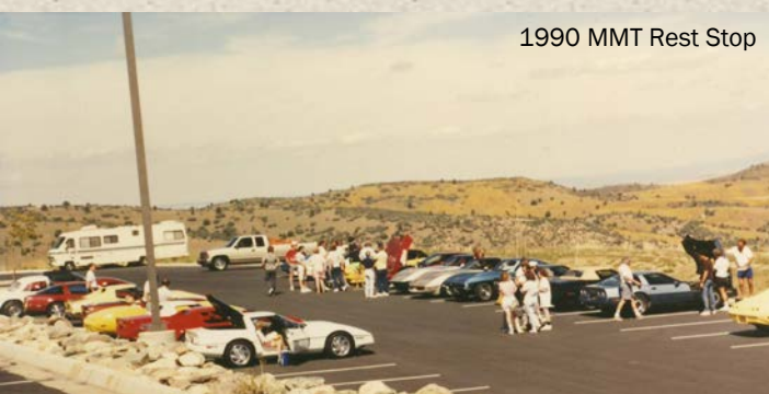
1990 MMT Rest Stop

MMT – For many years, the MMT destination was announced in advance, and the "mystery" part of the event was reserved for the planned activities. 1990 was one of the first, true "Mystery Tours" since the location was not announced [turned out to be Cottonwood]. In 1993, another "Mystery" tour was held with the theme "Planes, Trains, and Automobiles."